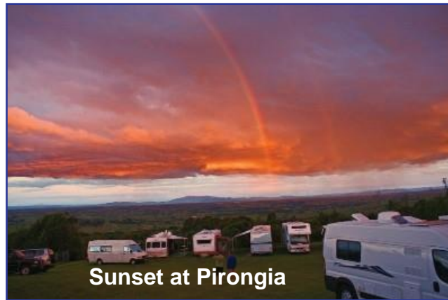
Sunset at Pirongia